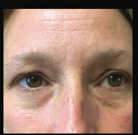
After 5 Treatments