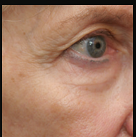
After 4 Treatments